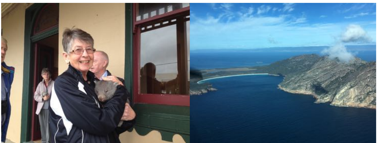
L: Insights guests admiring a cuddly cutie at Whitemark, Flinder's Island.