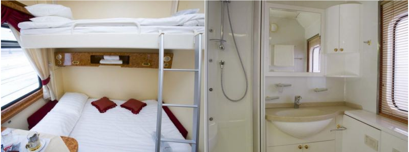
Images of the ensuite cabins on the Russian Railway's Trans Siberian train and below of the route

Our plans for Siberian Insights are evolving however we can report that the Russian Railway's Imperial Train operating across 7 time zones and 9,300kms from Vladivostok to Moscow will feature in this tour. The train provides first class service, dining and lounge cars and ensuite cabins. Our customary insightful touring will be arranged at places such as Lake Baikal, Novosibirsk, Kazan, Ekaterinburg and of course, Moscow. After visiting Moscow we shall travel by express train to St Petersburg and finish the tour there amongst the astonishingly beautiful Hermitage Museum and the Summer Palace of Peter the Great.