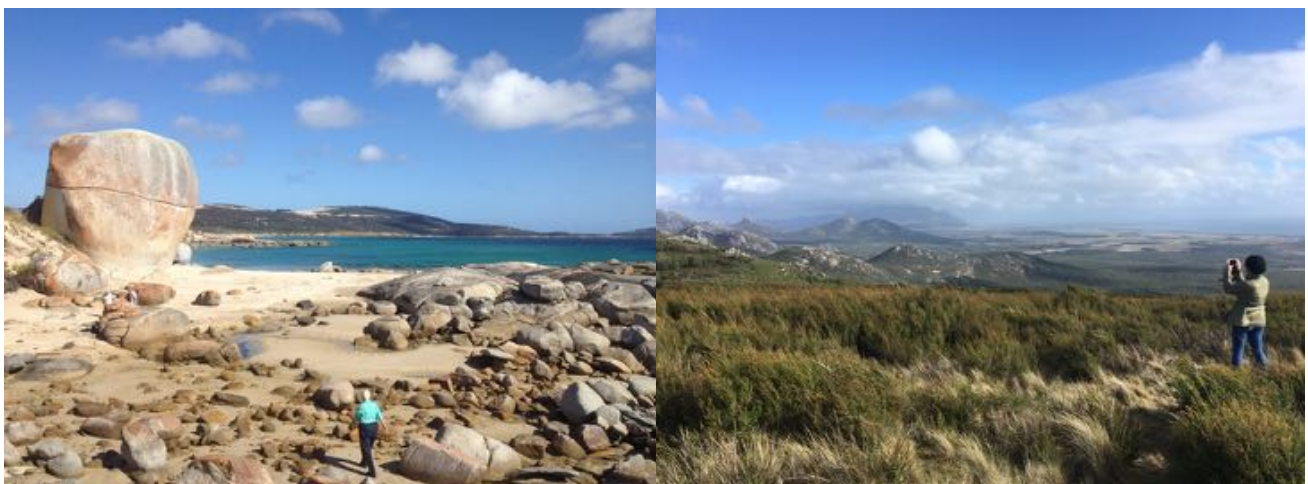
Insights guest J2 checking out the geological formations on Flinder's Island.

Our 17 th February departure is now fully booked but we do have 3 places available on our 1 st February departure.