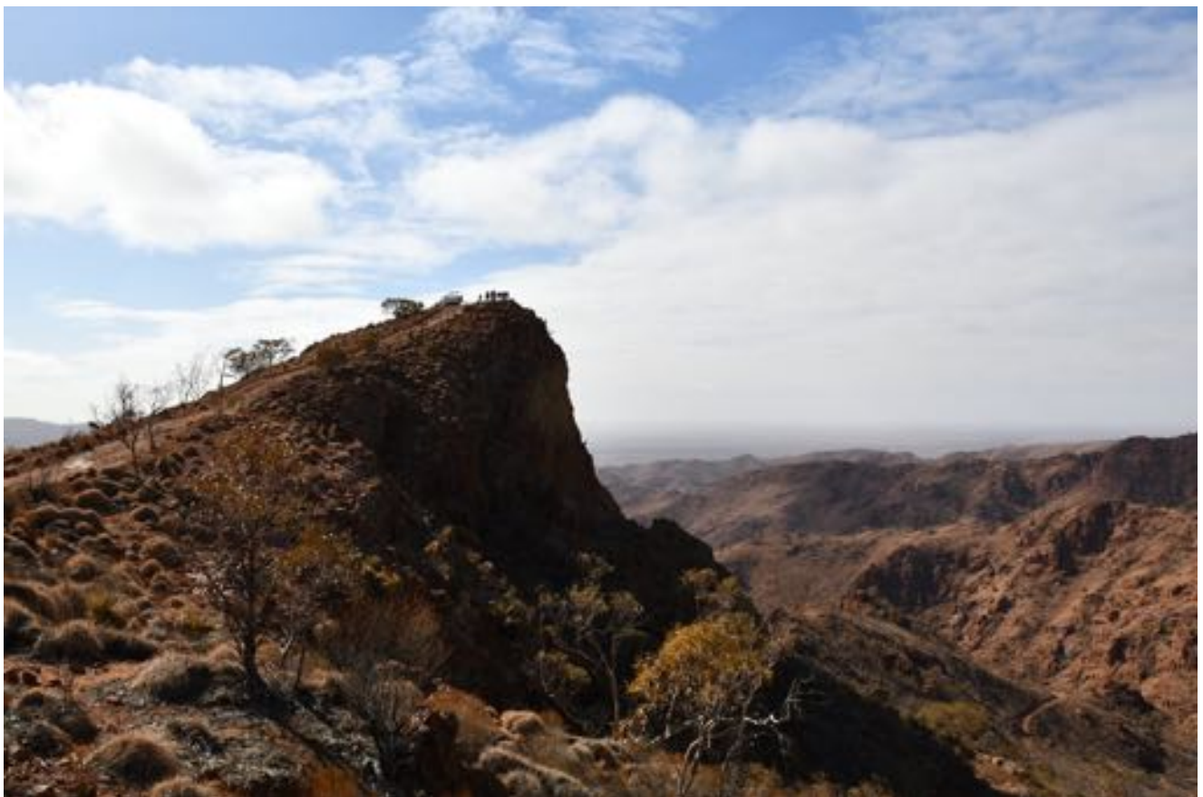
Siller's Lookout, Arkaroola Sanctuary on day 5 of Lake Eyre by Air.