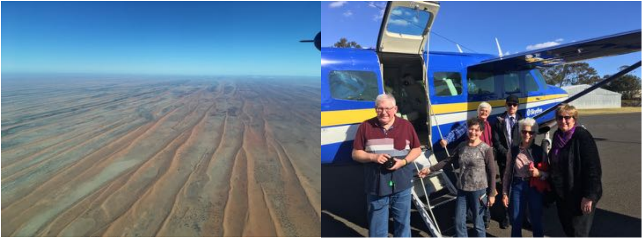
Simpson Desert west of Birdsville day 4 of Lake Eyre by Air.

Our 7 day / 6 night tour by chartered Cessna Caravan aircraft (pictured) to see the true Outback – Kilcowera Station, Thargomindah, Noccundra, Innamincka, Arkaroola, Birdsville, Broken Hill and Lake Mungo.