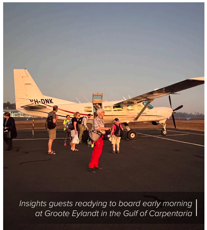
Insights guests readying to board early morning at Groote Eylandt in the Gulf of Carpentaria

Waitlist only for this departure. If you are interested in a future departure, please register your interest.